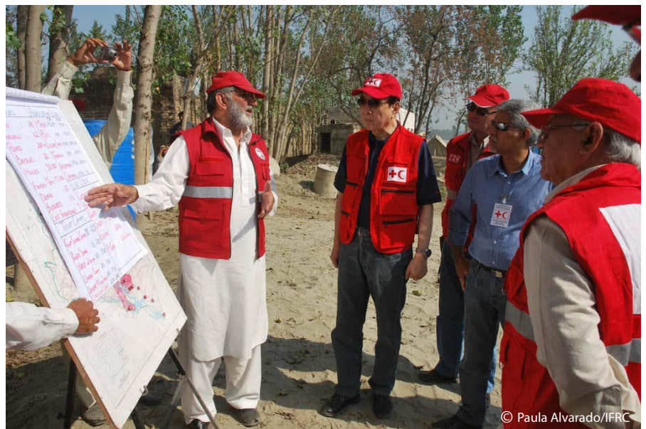
IFRC President Konoe being briefed on the needs of people affected by the severe floods.

President Konoe appealed to the international community for some 6.3 billion Japanese yen for long-term recovery initiatives such as medical care, water supply and sanitation. IFRC will assist in supporting temporary housing and rehabilitation for 130,000 families; however, there is a shortfall of approximately 1500 million yen.