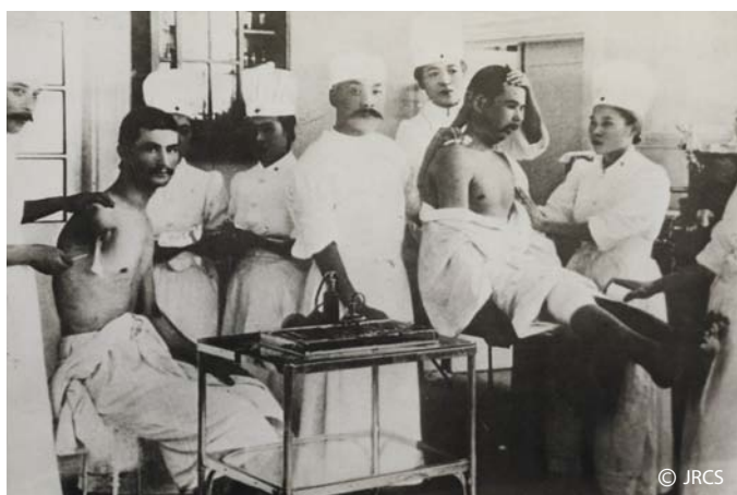
The crew of the sunken battleship Rurik being treated at the Sasebo hospital.

The year 1904 marked the outbreak of the Russo-Japanese War. The Japanese Red Cross, whose performance in the Sino-Japanese War was widely recognised, received a request from the Japanese government to send assistance to the field. In response, the Red Cross sent 152 aid teams as well as 5170 staff to Manchuria, Korea and Japan to work mainly in military hospitals. In addition, two medical ships, the "Hakuai-maru" and "Kosai-maru" were active in both Continental Asia and in Japan, and also contributed to the transport of Russian internees. Japan and Russia were both members of the Geneva Convention and the two countries worked together in humanitarian activities. At that time, ICRC couldn't set up the delegation in Japan for the geographical reason. So, it encouraged Red Cross societies of other countries to support Japanese Red Cross Society's mission and send the support fund to JRC.