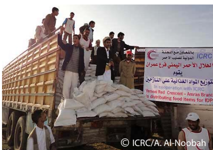
Bani Sureym, Amran governorate. Joint ICRC/YRCS teams distribute two-month food rations to nearly 2,100 IDPs from the district of Harf Sufyan (Amran governorate) and Sa'ada governorate.