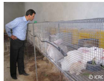
Rabbits provided as part of the self-reliance support project (Hebron)

issue. In a situation where the dignity of human beings is not protected, what is a life without hope? Thus among other considerations, the ICRC and similar organisations, as well as the international community, must continue to be cognisant of the suffering of civilians in this, and other regions of the world.