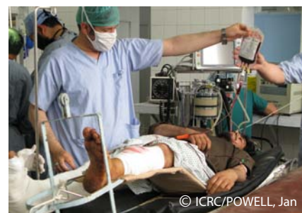
Operating theatre, Mirwais Hospital, Kandahar.