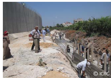
The ICRC's flood countermeasure project (Qalqillya)

The Palestinians living in Area C of the West Bank are not authorised to build their houses with a free hand. In fact, in the West Bank area and East Jerusalem, within a 3-month span this year, not less than 14 houses were demolished by the Israeli authorities. Still, with the increase in population, many Palestinians continue to construct or extend their houses without building permits in this area, while being prepared that they may be demolished one day. This instability affects family structures; for