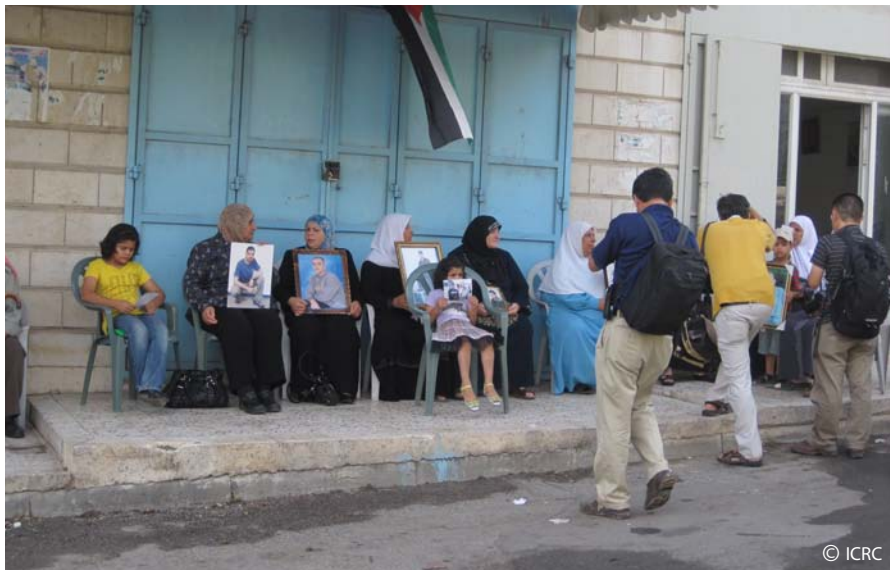
In front of the ICRC office in Tulkarm: Palestinians holding pictures of imprisoned relatives calling for information about whether they are safe or not, and Japanese and Chinese media gathering materials

Living without threats to human dignity is difficult for the Palestinians in the Occupied Territories, especially in the region called "Area C" in the West Bank. Encompassing more than half of the West Bank area, "Area C" includes Israeli settlements, is under the civilian and military control of Israel, and movements in this area are highly restricted. In many cases, the occupants of the area have to take a detour in order to avoid checkpoints and barricades, thus spending much more time than they should to reach their destinations. Ambulances run by the Palestine Red Crescent Society are not an exception as there have been cases when patients died during