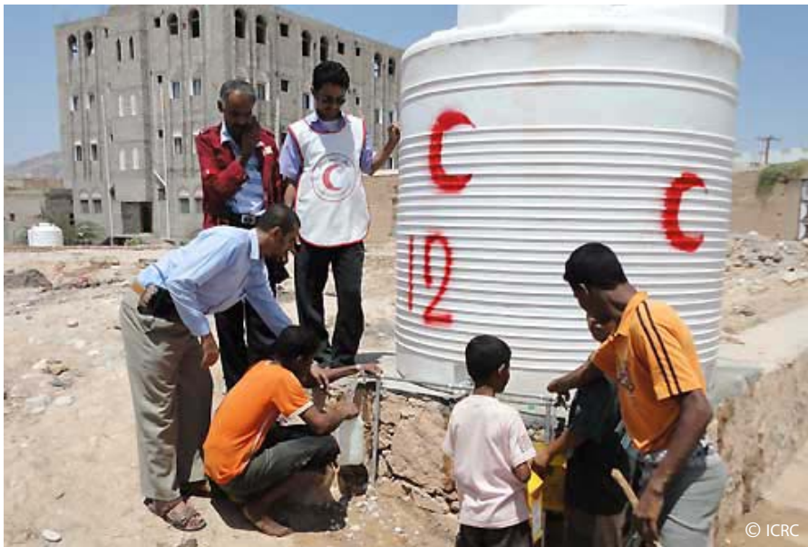
Azzan, Shabwa governorate. Over 4,300 IDPs who had fled the nearby city of al-Hota because of fighting are benefiting from 89,000 litres of water per day.

The fighting that erupted in the end of September 2010 in southern Yemen has forced thousands out of their homes. In the north of the country, thousands more remain dependent on humanitarian aid. The ICRC is working with the Yemen Red Crescent Society (YRCS) to supplying urgently needed assistance.