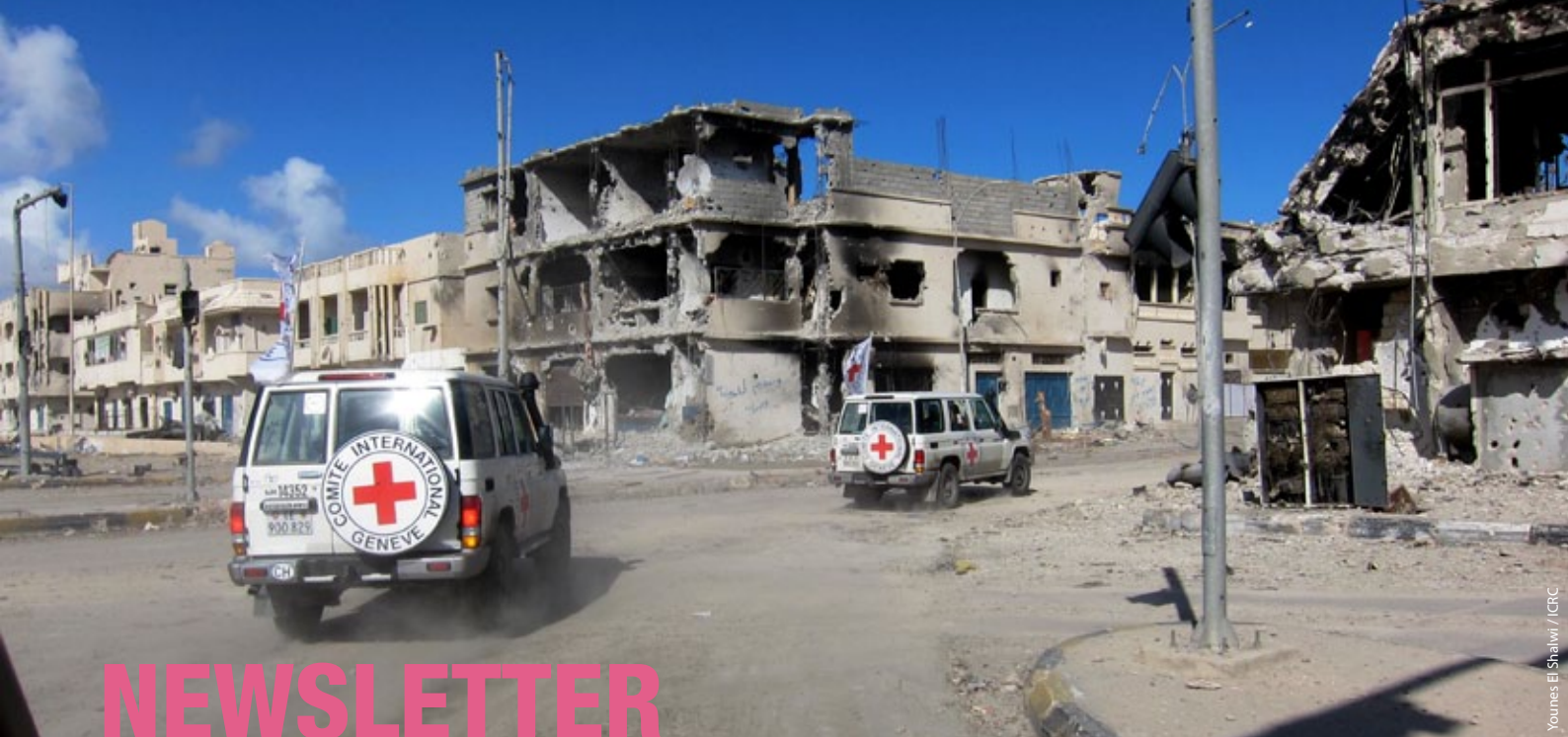
Younes El Shalwi / ICRC