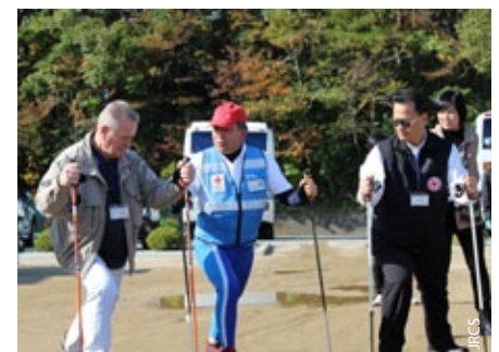
RCRC representatives participating in the 'Nordic Walking'

The RCRC representatives noted how touched the residents were by the JRCS's activities and interest, and said that they would share their experiences with others in their respective countries who had contributed to the relief fund.