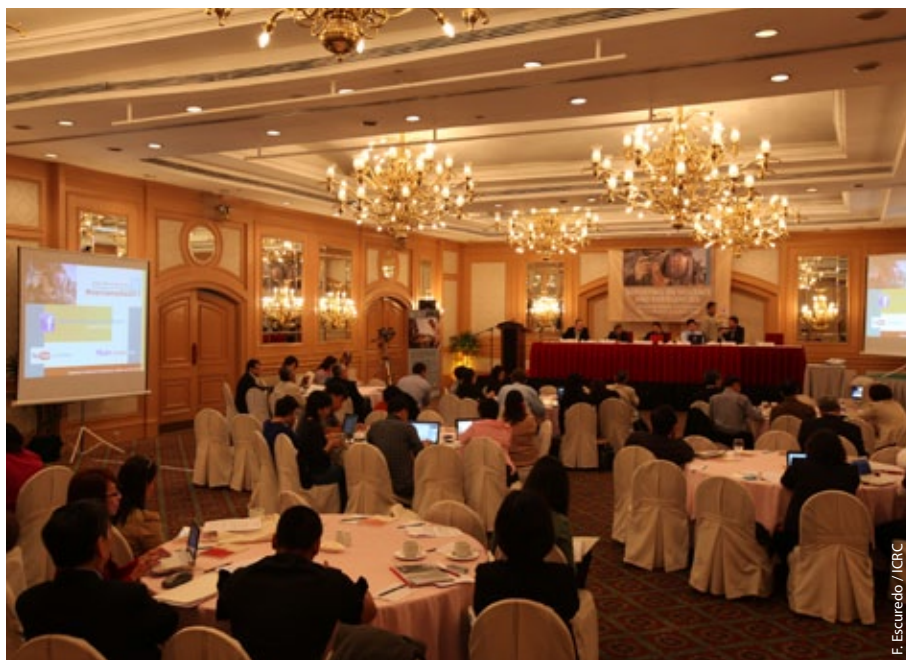
F. Escudero / ICRC