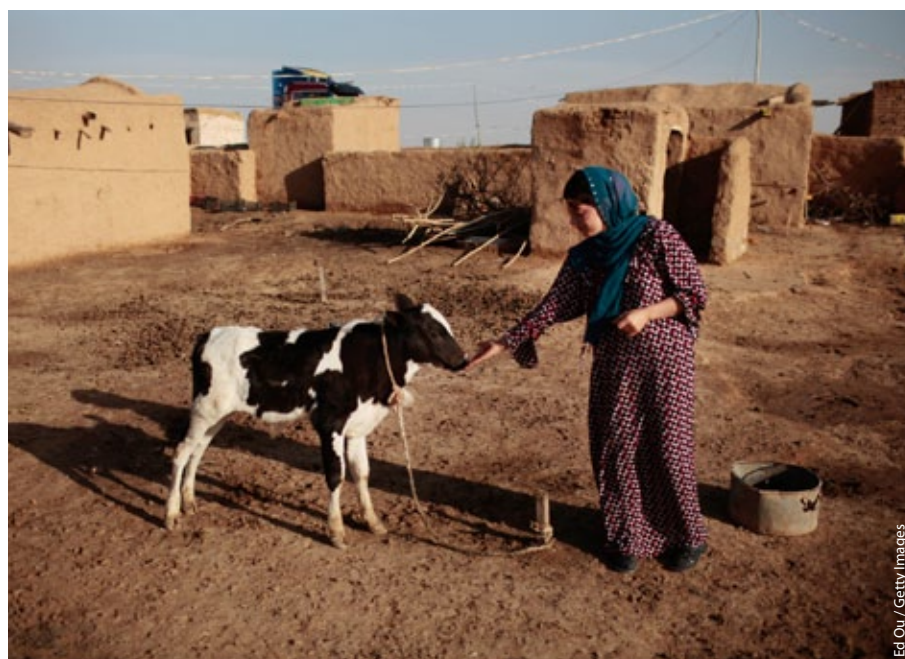
Kirkuk, Iraq. A woman feeds a cow that was donated to her by the ICRC as a micro-economic initiatives programme. During a picnic near the Iranian border in 2001, she stepped on a landmine and lost a leg.

As he leaves Iraq after two years, he concludes ICRC's work in Iraq as follows. "As the country develops its great economic potential, the ICRC has scaled back and focused its assistance services. Nevertheless, we will continue to reach out to vulnerable groups and areas, and to provide the authorities with technical advice on how essential services can be improved. Dialogue with the various authorities is good and continues to develop. Being present on the ground is necessary to be able to help efficiently. The context is complex and sometimes dangerous owing to the armed conflict and other violence. Nonetheless, it is still possible to carry out humanitarian activities there."