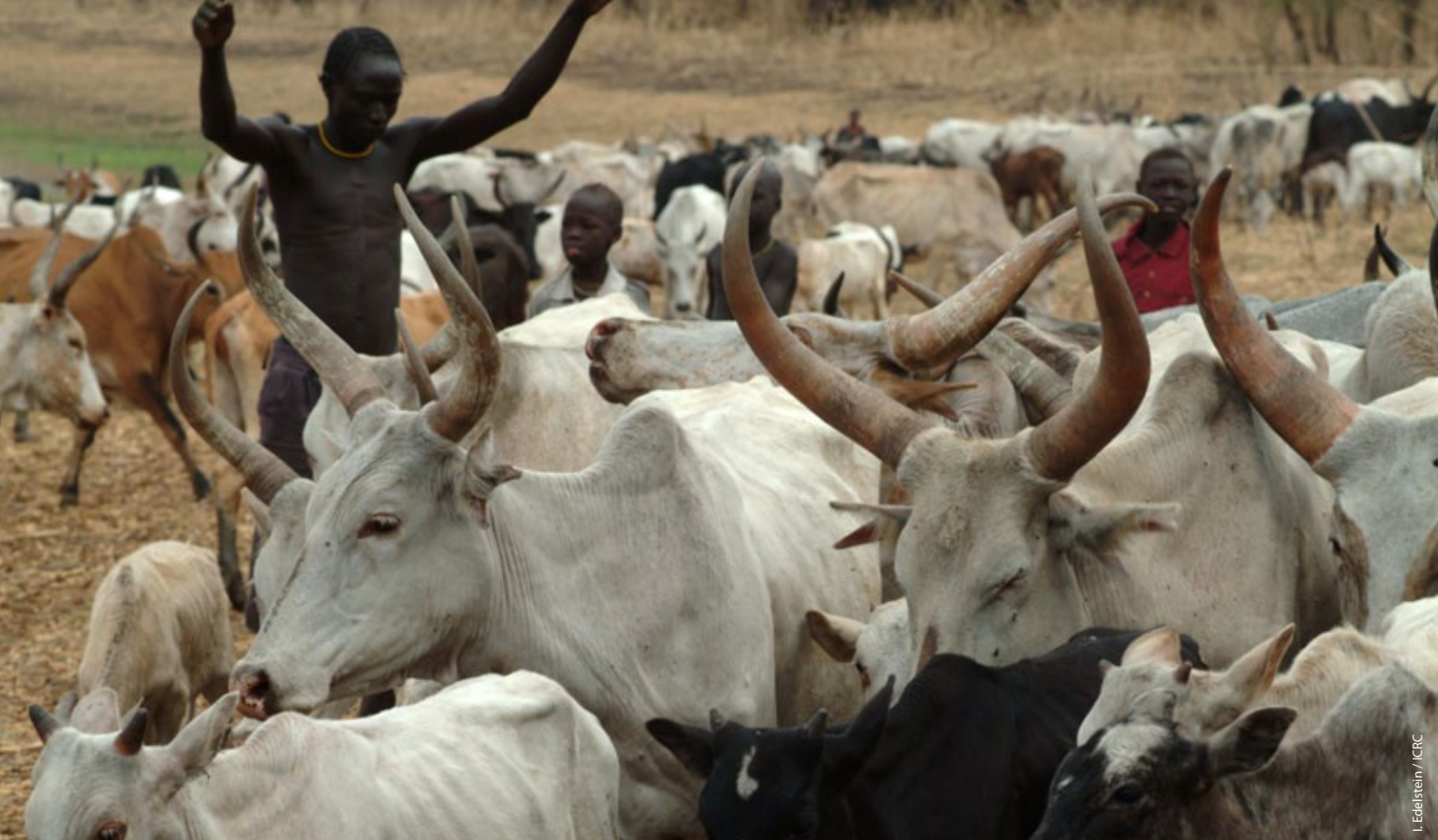
Jonglei State, South Sudan. Herders round up their cattle for vaccination of bacterial infections before the beginning of rainy season.