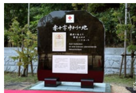
A monument placed at the site of Bando detention shows the presence of the Red Cross