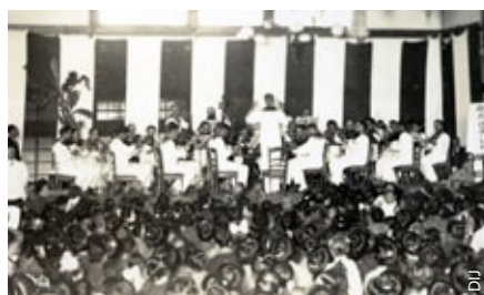
POWs in Bando detention playing the symphony

to buy even the essential goods for life. They thus heavily depended on money and valuables from their relatives and friends back home, for which the ICRC played a vital role in transfer. The goods collected by the ICRC's Central Agency for POWs in Geneva were then sent to The Committee for POWs established by the Japanese Red Cross Society, and to the POWs through the cooperation with the Japanese Imperial Information Office of POWs. With this financial support from their families and friends abroad, soldiers could buy alcohol and cigarettes and enjoy them with other prisoners.