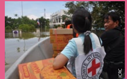
Thailand. Delivering dry foods, torches and anti-mosquito sprays with Thai Red Cross Society.

Thailand has experienced its worst floods in decades, with more than two-thirds of the country affected. The ICRC has assisted 30,000 prisoners, providing them with much-needed supplies and is also working with the prison authorities to help evacuated detainees let their relatives know where they are.