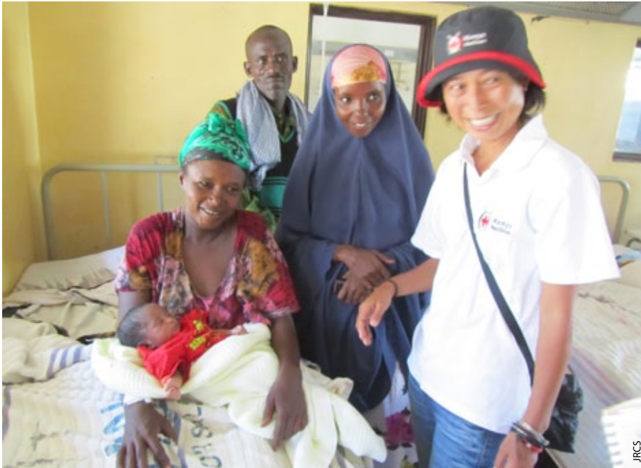
"It is important that the people themselves take charge to make a change in the community," a JRC staff says.

Activities of/with the Japanese Red Cross Society & the International Federation of RC/RC