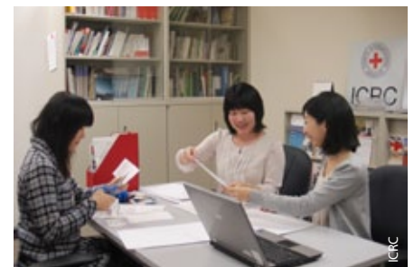
Preparation for events and sending out newsletters are also part of the interns' tasks.